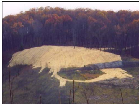
Figure 3. Temporary ECB on Slope