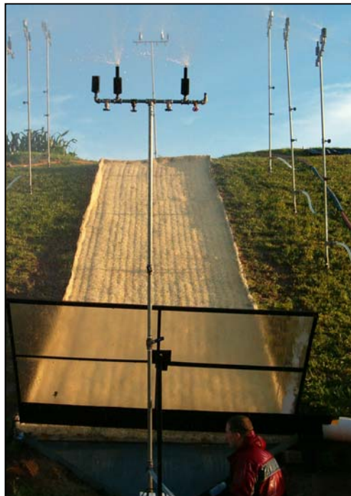
Figure 7. RECP During Testing