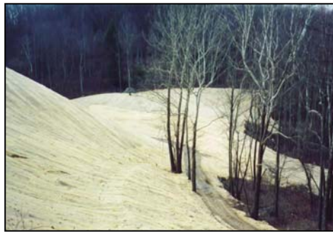
Figure 1. Temporary ECB on Slope