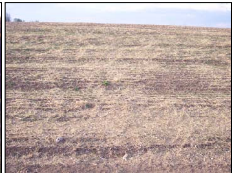
Figure 4. Blown Straw on Slope