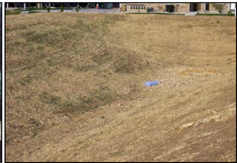
Figure 2. Blown Straw in Detention Pond