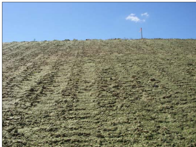
Figure 9: This Site Has No Shadowing on the Hillside.