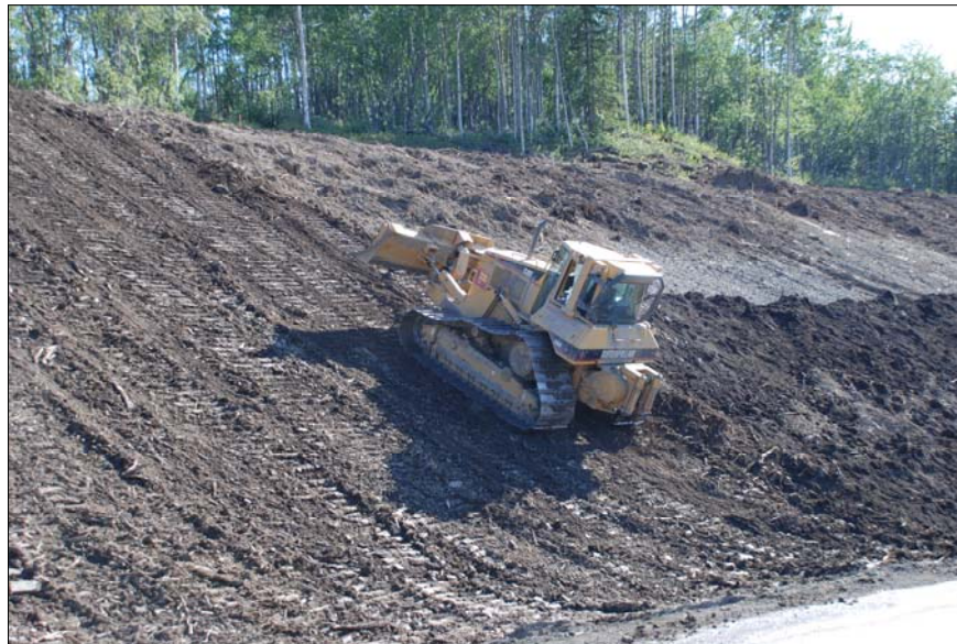
Figure 2: Embankment and Fill Areas Should be Rolled with a Crimping or Punching Type Roller or Track Walked so that Track / Cleat Marks from the Equipment Form an Indentation on the Slope that is Parallel to the Contour of the Slope (Perpendicular to the Flow of Water Moving Down the Slope).

Site reconnaissance and data collection is important to engineer the project appropriately. The designer should use the data collected when developing the project. Examples of site data needed would in-