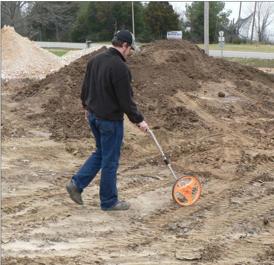
Figure 1: Measure the Area to be Treated to Calculate the Amount of HECP Needed at the Desired Application Rate.

meet this updated industry standard naming practice. For further information on HECP classification, please refer to Standard Specification for Hydraulic Erosion Control Products published by Erosion Control Technology Council www.ectc.org/toolbox .