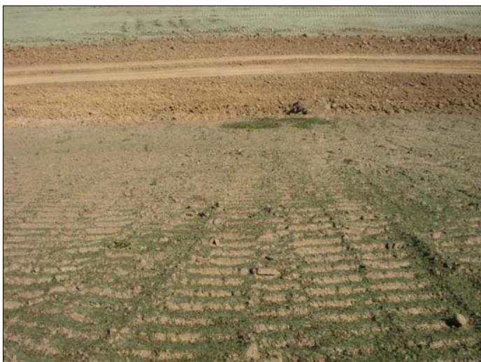
Figure 8: This Site Shows Shadowing on the Hillside.

they are not sprayed in opposing directions, a “shadowing” effect may occur. Ideally, the HECP will be applied from the toe of the slope and from the top of the slope. However, this is not practical for all projects due to access feasibility. It is acceptable for when the contractor does not have access to both the top of the slope and bottom of the slope for the contractor to apply the HECP from locations for which they have access. For such scenarios, the contractor can spray forward and then backward as their hydraulic seeding machine proceeds parallel to the slope.