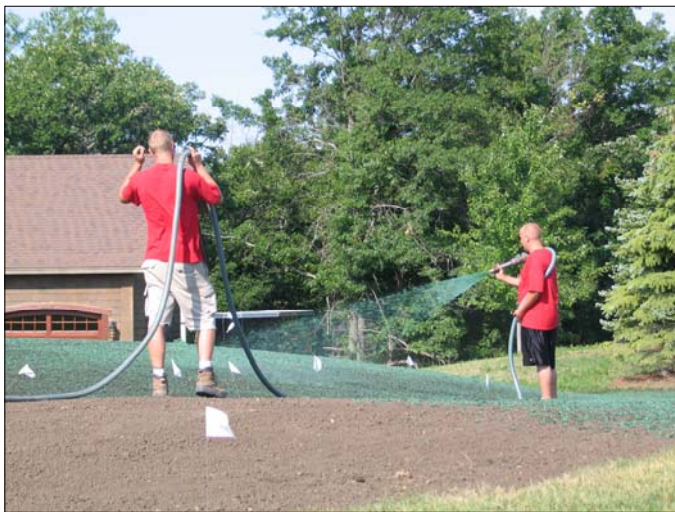
Figure 6: An Example of the Hose Technique.

There are two techniques for applying HECFs: the tower technique and hose technique. Both have their advantages and disadvantages. The tower technique is often used for hard-to-access locations such as very steep slopes. The tower technique will also allow the hydraulic seeding machine to cover an area at a quicker rate thus reducing the installation time as compared to the hose technique and RECF. However, the hose technique allows for greater control when applying the HECF. For example, when the