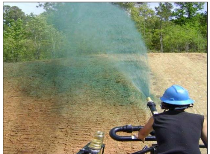
Figure 7: An Example of the Tower Technique.